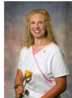
Portrait Package Photo

After the class photo, the photographer will be available for portraits or "Buddy Photos". The Portrait Packages can be of you alone, or a small group, and are available in packages of 8x10's, 5x7's and wallets (see order form). Buddy Photos are for you and a friend, classmate or family member. Two or three people are best for this photo but we will try to accommodate larger groups.